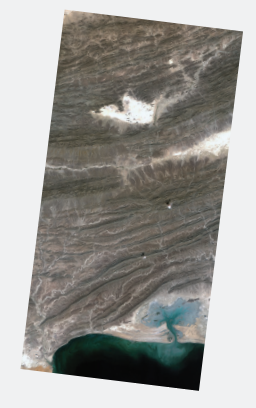
The RapidEye Ortho Take Product (3B) extends the usability of orthorectified RapidEye products by leveraging full image takes and adjusting multiple images together to cover larger areas more accurately with fewer files. Each 3B product is a full swath-width orthorectified image that has been adjusted and trimmed to ensure the accurate placement and complete coverage.